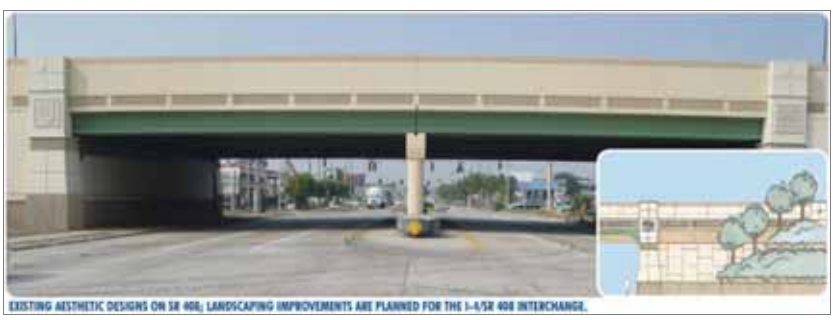
Photosimulation of new underpass with decorative features

The high traffic volumes and downtown location are similar to the I-81 corridor through Syracuse. However, this corridor is in a rapidly growing city, which was a factor that led to the decision to expand the highway. Because this highway is also a toll road, with specific planning, access and financing considerations, the range of alternatives was considerably narrowed.