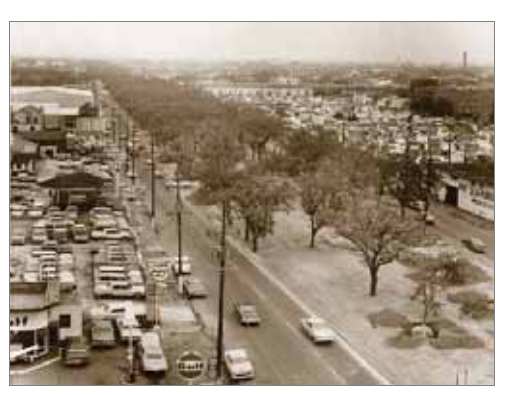
Historic Claiborne Avenue

and establishing a boulevard similar to what was in place before the highway, should serve these goals<sup>9</sup>.