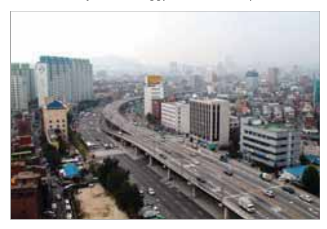
Before: Cheonggyecheon Freeway