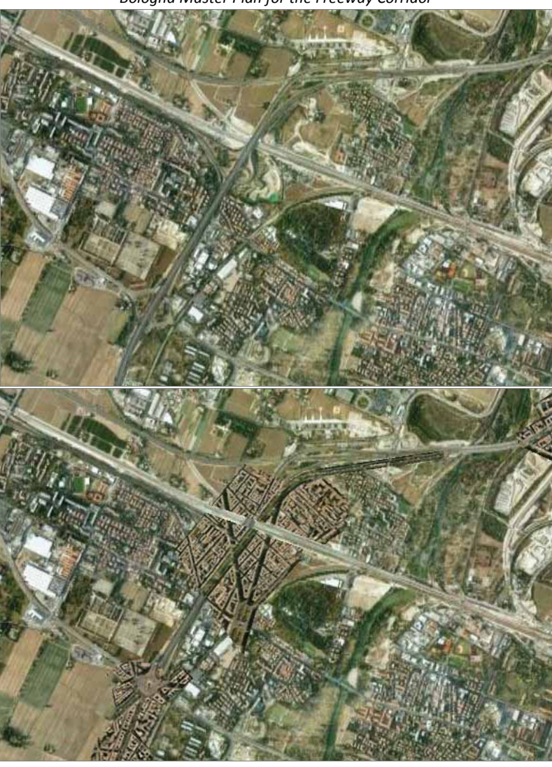
http://www.avoe.org/bologna2020.html (images used with permission)